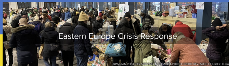
Eastern Europe Crisis Response